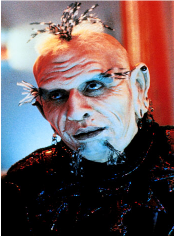
Image from Start Trek III

The strong men of Titan, Saturn's largest moon, consider repetition to be a sin. However, they only have 3 sounds that they can make "Kah", "Brrrr", and "Umph" (Let's call them K, B and U for short.) so it is sometimes difficult not to repeat.